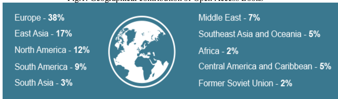
Fig.1: Geographical contribution of Open Access Books