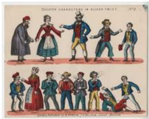
Fig. 3. The original, uncut version of Pollock's illustrations for Charles Dickens's Oliver Twist , meant to be cut out and used for puppet theatre.