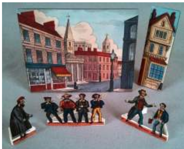
Fig. 4. Although the original illustrations were visually appealing, they were made with light-sensitive watercolors. This cut-out 3D puppet version offered something extra that helped convince the curator to use the facsimile instead of the original. Courtesy of Meg Brown