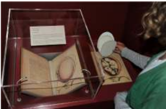
Fig. 2. A visitor interacts with a surrogate of an anatomical model from George Spratt's 1841 Obstetric Tables , Huntington Library.

There are times when library items are too delicate to be handled as desired, but book conservators strive to prepare