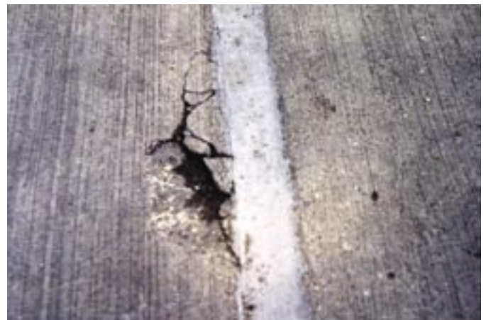
Fig. 3: Cracking and edge spalling behind the flange connections can occur if the joints are not properly detailed