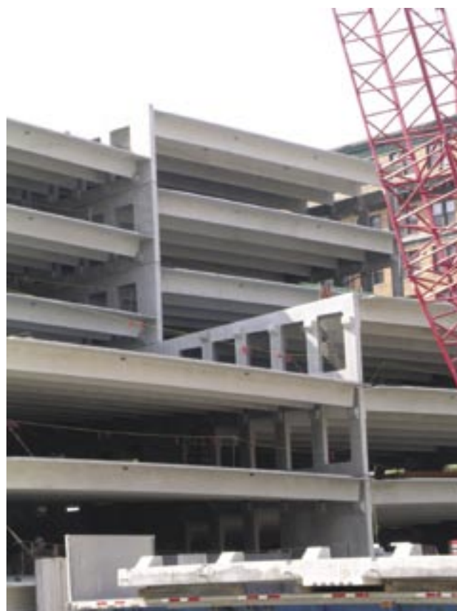
Fig. 1: A partially-completed precast concrete parking structure consisting of key components including columns, double tees, inverted tees, and shearwalls

Precast elements must be joined together within defined horizontal and vertical tolerances, with provisions