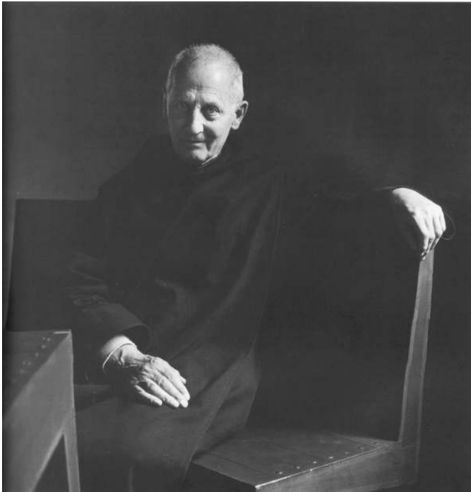
The Benedict monk, priest and architect Dom Hans van der Laan (1904-1991) designed the so-called architectonic space. His basic building block of the environment is the plastic number.

has only zeros of modulus 1. The above results concerning the factors of trinomials apply directly to the morphic numbers. A morphic number is a common root of two polynomials and its existence entails a common polynomial factor (with integer coefficients).